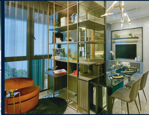
1 - Bedroom

TYPE (1)a #05-02 to #08-02 #05-05* to #08-06* 41 sq m incl. A/C ledge 2 sq m, Balcony 5 sq m 5 sq m